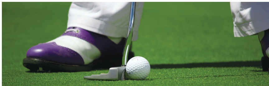
PAGE 7 | THE 2020 HOPE GOLF CLASSIC