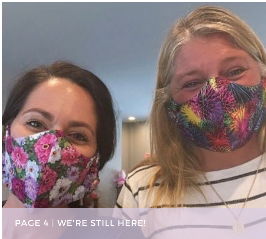
PAGE 4 | WE'RE STILL HERE!