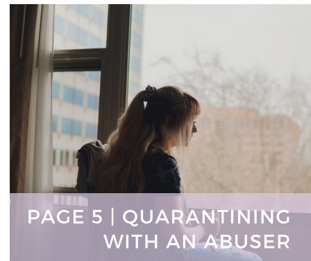
PAGE 5 | QUARANTINING WITH AN ABUSER