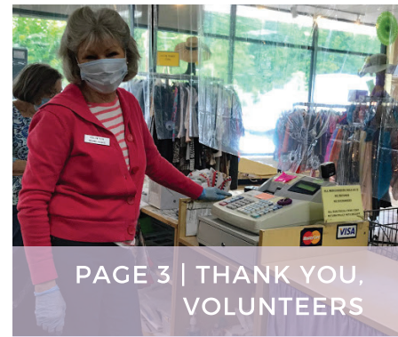
PAGE 3 | THANK YOU, VOLUNTEERS