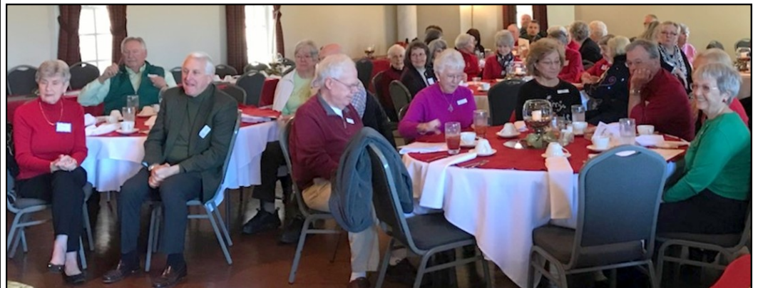
Second Chance Thrift Store year-round volunteers and employees and Steps to HOPE staff and board members enjoy a delicious brunch at Green River Plantation in Rutherfordton, NC to celebrate the holidays

violence and sexual assault in our community. Steps to HOPE provides shelter and treatment to victims and their children. Many thanks go out to Parsec Financial for their generous sponsorship this year.