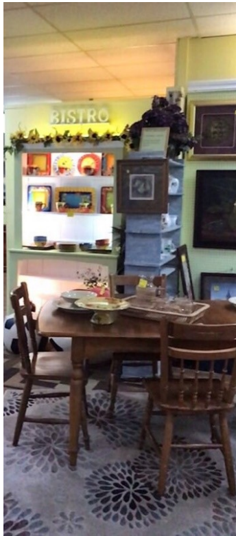
Beautiful rugs, tables, chairs, dishes, framed art and more are priced very reasonably at Second Chance Thrift Store!

Columbus' favorite thrift store needs your gently used, quality donations as much as ever!