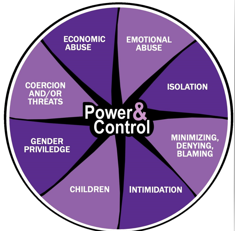
The Power & Control Wheel illustrates the many ways an abusive partner can manipulate a relationship. For a more in depth copy, call or stop by Steps to HOPE!