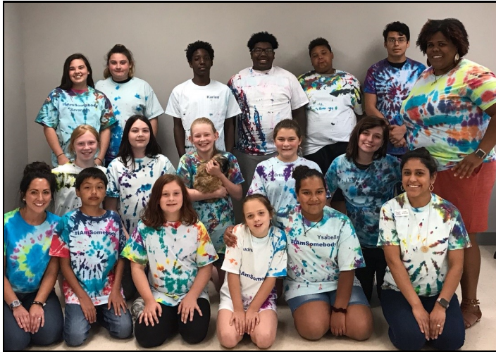
2019 #iAmSomebody Day Camp participants wearing the tie-dye shirts they created. Just like the shirts, each camper is unique and beautiful!